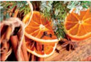
There are different kinds of gifts, but the same spirit is the source of them all. Out 12.4